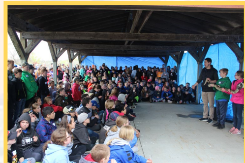
Natural Resources Festival