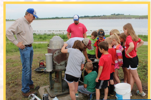
Field Trip Opportunities